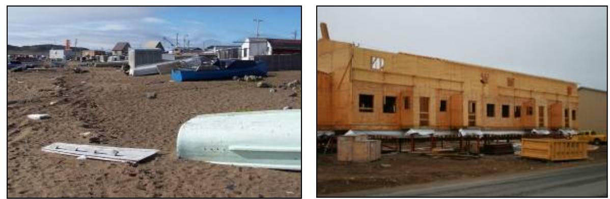
FIGURE 5. (Left) Hunting and fishing sheds and boats used in the local small-scale traditional subsistence economy. Despite appearances, these represent quite substantial capital investments. (Right) Construction of housing units near the Iqaluit waterfront. Photos: SVH, August 2010.

A portion of Iqaluit's population continues to engage in traditional hunting and subsistence practices despite increasingly rapid social changes and widespread participation in the wage economy. The land claims agreement that established Nunavut as a self-governing territory within Canada was finalized in 1993, and this agreement selected Iqaluit as the territorial capital because it was the largest settlement in the newly formed territory. This iconic designation also brought it into the role of a cultural hub for efforts to sustain and nurture the Inuit way of life. This also saw the beginning of significant social change in Iqaluit, as the population began to grow rapidly and the influx of money for development spurred infrastructure development (Lewis & Miller, 2010). Nevertheless, an important part of the economy in Iqaluit remains rooted in the traditional hunting and subsistence patterns of Inuit.