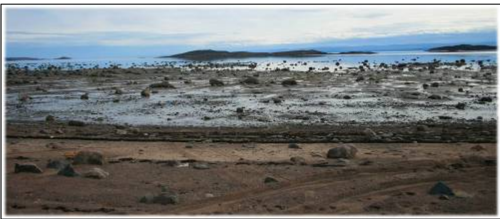
FIGURE 2. View from the beach at low tide, showing the extensive intertidal boulder flats extending seaward from the Iqaluit waterfront. During a low spring tide, the water line would recede all the way to the last visible boulder. Photo: SVH, August 2010.

Frobisher Bay lies at the southeast end of Baffin Island in the Canadian Eastern Arctic (Fig. 1). The narrow bay is a product of its geological history, including sculpting by ice during and following the Last Glacial Maximum (Hodgson, 2003, 2005). The area is underlain by resistant granitic rocks, which are widely exposed with a discontinuous cover of sandy glacial till and postglacial deposits of raised marine deltas in the valleys. The City of Iqaluit sits on Koojesse Inlet near the head of Frobisher Bay, which is aligned roughly WNW-ESE, with high topography to the north and south. The harbour is exposed to the southeast with partial protection from islands in the head of the bay. The setting is 'macrotidal' with tidal range from 7 m (neaps) to 12 m (springs). Wide intertidal boulder flats extending 500 m out from the high-tide shoreline (Fig. 2) are underlain by thick, indurated silt and clay with a thin cover of sand and gravel with scattered cobbles and boulders. The tidal flats appear to have formed by erosion of proglacial brackish outwash sediments underlying part of the urban core (McCann et al., 1981; Hodgson, 2005).