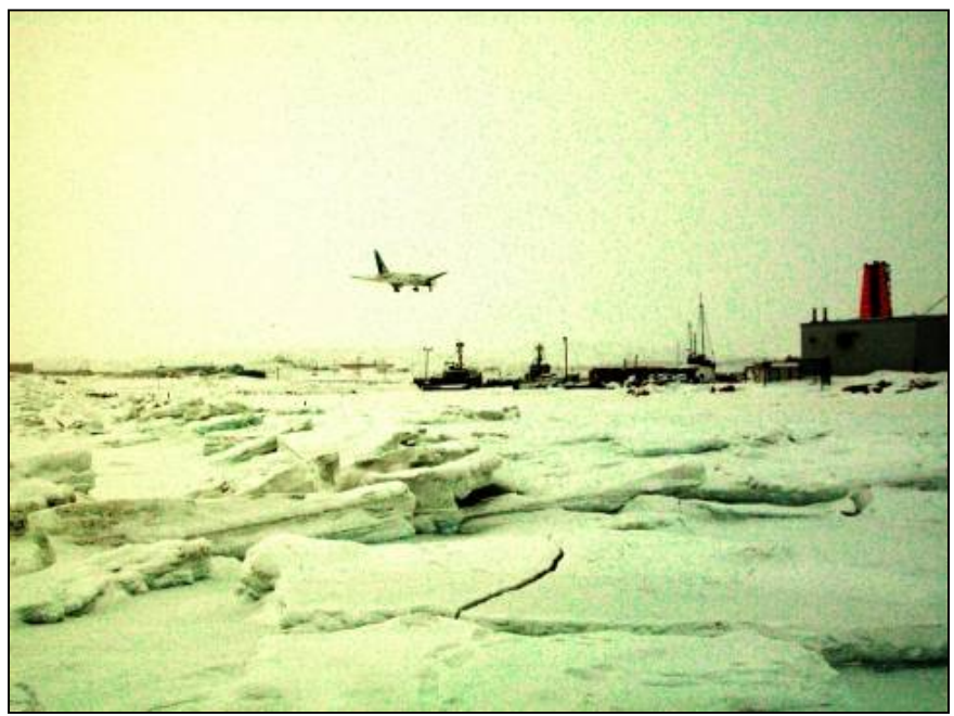
FIGURE 3. Shoreline of Iqaluit showing areas of previous ice ride-up. After the establishment of the ice foot, large floes of mobile ice can be thrust up on top of the landfast ice. This can occur at high water levels, which can flood the back of the icefoot and encroach on the city shoreline. Photo: SVH, February 2011.

There is abundant evidence for Arctic warming over the last 30 years and the area around Iqaluit has experienced some of the most rapid warming in the last decade (ACIA, 2005; Bekryaev et al., 2010). Over the circumpolar Arctic, this has led to extensive ice loss and widespread extension of the ice-free season (Gough et al., 2004; Johannessen, 1999; Markus et al., 2009; Smith, 1998). Closer to the study area, Markus et al. (2009) reported a consistent expansion of the ice-free season in Baffin Bay by 8.3 days/decade, with onset of freeze-up in the fall delayed by 3.2 days/decade. Thus, over 30 years, freeze-up is retarded by about 9.6 days. This could mean the difference between a storm passing over water heavily laden with ice, or over water that is almost ice-free. The fetch over open water could mean the difference between a heavily damaging storm with waves, or an early winter wind event over ice (quite common in Iqaluit).