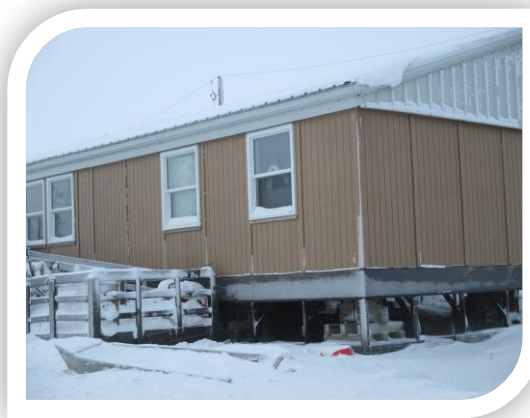
Examples of steel piles and mesh skirting around a house.

Project partners and stakeholder groups had the chance to meet over the span of 3 days in informal knowledge-sharing meetings that were hosted by GSC. The purpose of these meetings was to incorporate traditional knowledge into areas that GSC has been studying. It was a very interactive meeting, with markers available for attendees to show directly on regional maps what permafrost activity they have observed. The Climate Change Section was at the meetings to provide plain language and technical support by being the meeting recorders. Although the mapping areas GSC covered were all outside of the community area, there was a lot of discussion on areas in town that are being impacted by shifting permafrost. It would be worth going back and possibly doing a study within the community boundaries where a number of permafrost