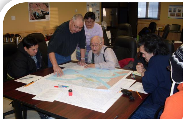
Elder's attend a mapping workshop where they record areas of permafrost activity.

Having Elders involved in the workshops proved to be very beneficial and highlighted invaluable information. Elders noted changes to the landscape and water bodies outside of town, and commented on how water levels of freshwater bodies have dropped over the years. This is an important piece of knowledge because they have been hunting and traveling on this land for generations. They also noted that the landscape in and around town has changed, with water bodies being filled in or altered. Although they had a large amount of input for other climate change observations, the permafrost changes are what the workshop especially focused on.