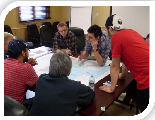
Stakeholders record and observe areas of permafrost activities during a workshop.

Perspective on the development of these activities.