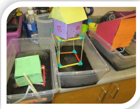
Fun activities for elementary students learning about the impact of permafrost on building foundations