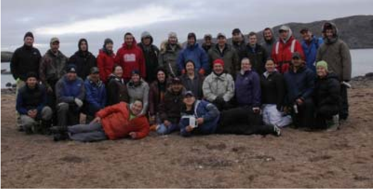
2011 Environmental Technology Students in Iqaluit