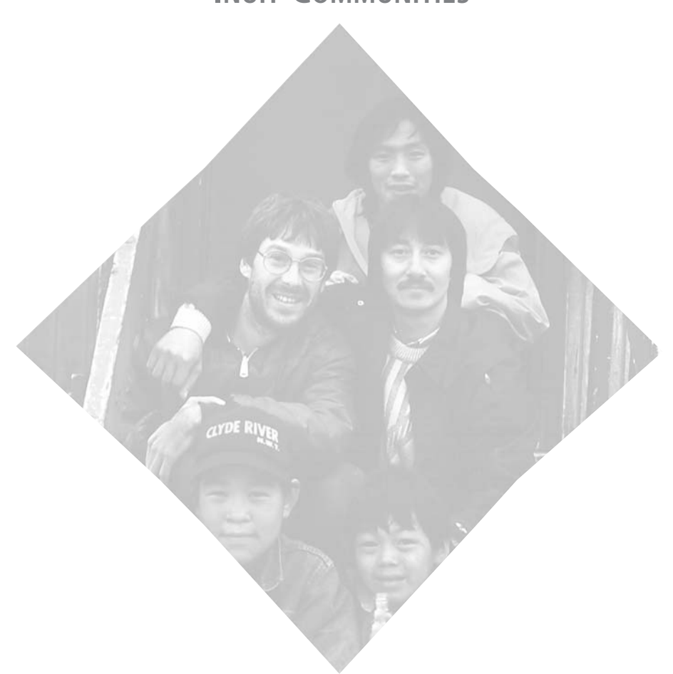
A Guide for Researchers