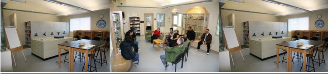
The Nunavut Research Institute's headquarters and science campus in Iqaluit features modern infrastructure supporting environmental education, research and technology.